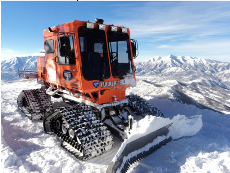
(2) Each 2013 2000BXL W/8' 6-Way Blade 26" All Rubber Terra-Tracks

If you are interested in purchasing a demonstrator please contact our sales department. We manufacture demo units for both testing and demonstrations. Purchasing a demonstrator can be beneficial. We sell our demonstrators at a discounted price yet still offer the factory warranty. Currently we have the following demo's available for immediate delivery!