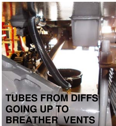
TUBES FROM DIFFS GOING UP TO BREATHER VENTS