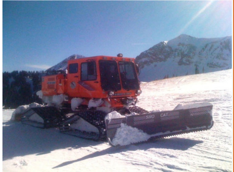
2013 2000E 5-Pass, 12-Way Blade / & Tiller 38" Tucker Rubber Bar Tracks