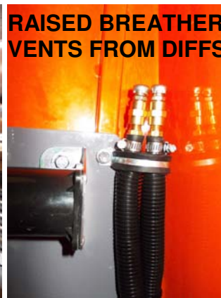
RAISED BREATHER VENTS FROM DIFFS