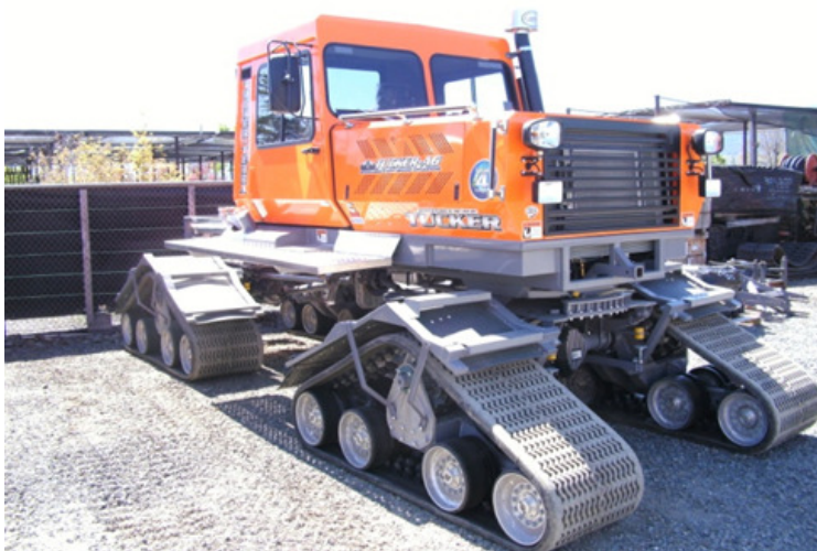
2013 1642E AG, Farm Fenders & Cat Walks 26" All Rubber Tundra Tracks