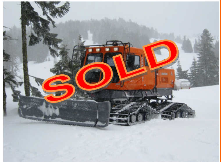
2011 2000D1 5-Passenger & 12-Way blade 38" Steel Belt Tracks